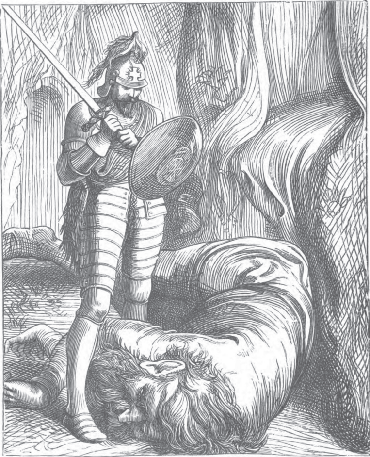
Fides Slays the Giant Sloth

indolent by disposition, had felt the moral touch her in the description of unfinished work.