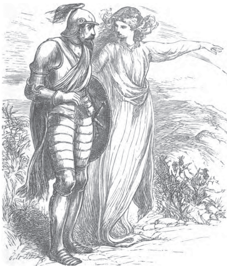
Knight Fides and Conscience

“Breathe upon the hilt of your sword, and you will behold me beside you. Though unseen, I will ever be near you. Delay not now, for, look at the sun, what a flood of light he pours on the world! When the great clock in the giant’s tower strikes six, it will be too late to encounter him that day; he may vanish before your eyes, but neither be conquered nor slain. Go!” And even as the words were upon her lips, the bright one vanished from his sight.