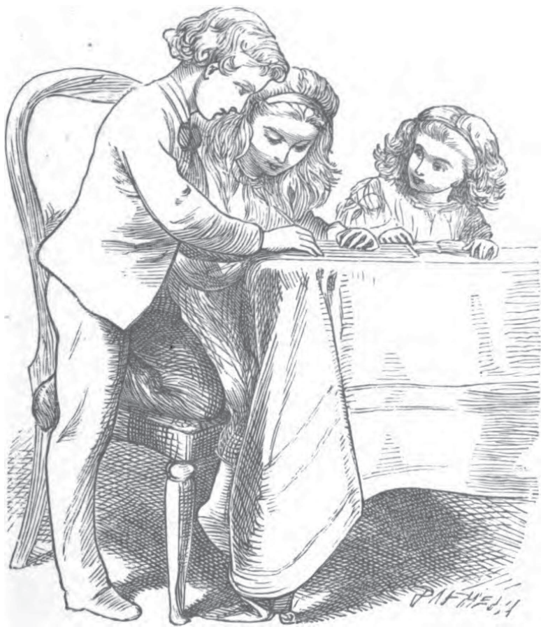
Helping at Lessons

Quiet and reserved as Mr. Roby was, it was no small trial to him to introduce strangers into his peaceful home, though these strangers were the nephews of an intimate friend; it