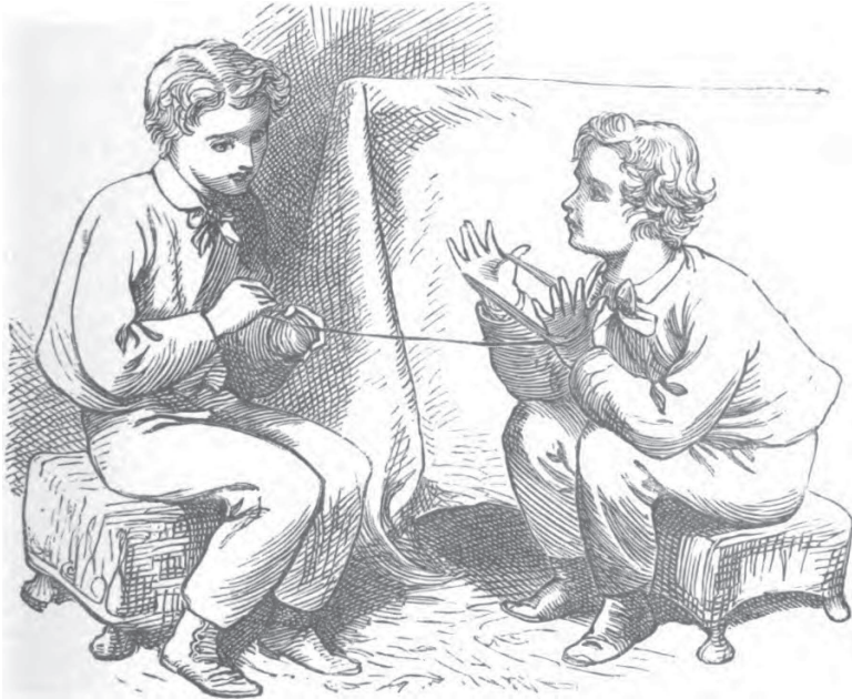
Winding the Skein

"I should like to hear this story," said Constantine, afraid of the lady's returning to the "Successful Merchant."